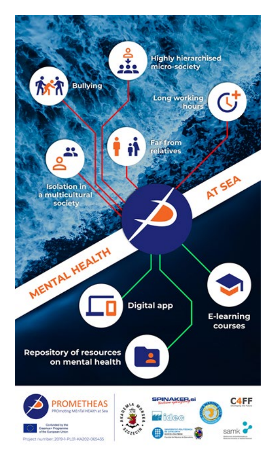
Figure 2. Key aspects of PROMETHEAS project

As shown in the figure above, seafarers work on a hierarchical macro society where crew members work long and often irregular hours in an isolated and multicultural environment where bullying and harassment can be a major issue.